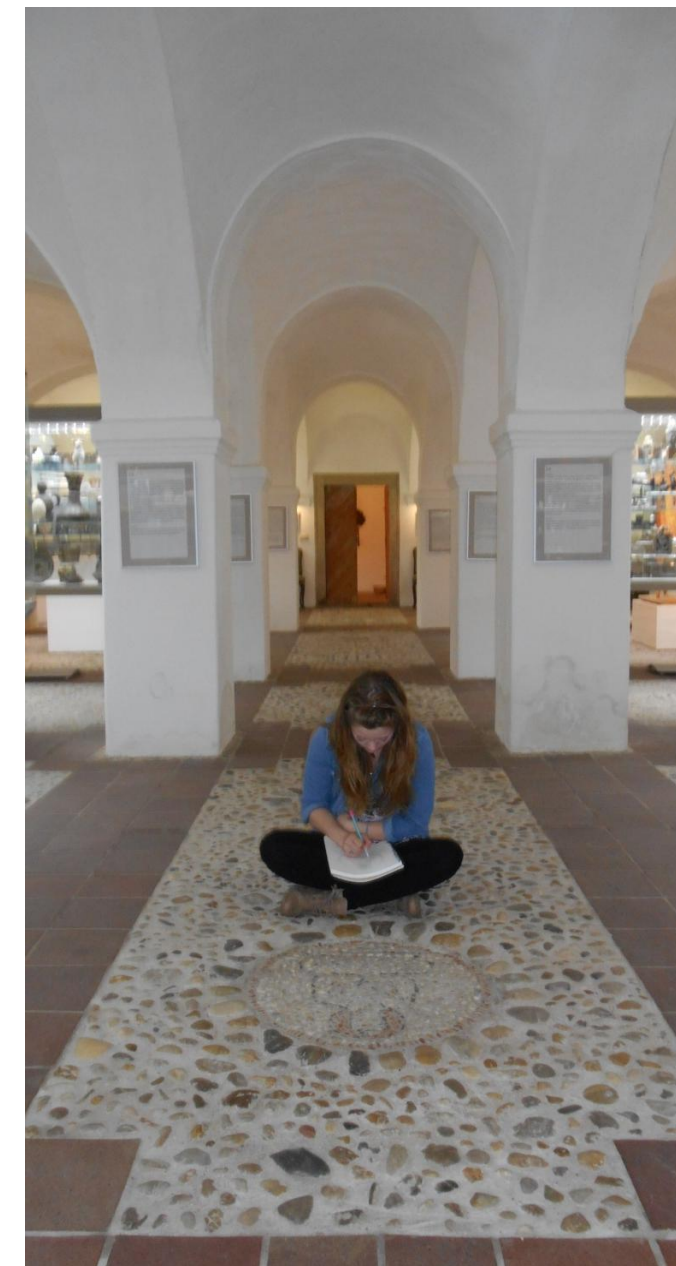
In the Arcade Passage of the Museum Humanum